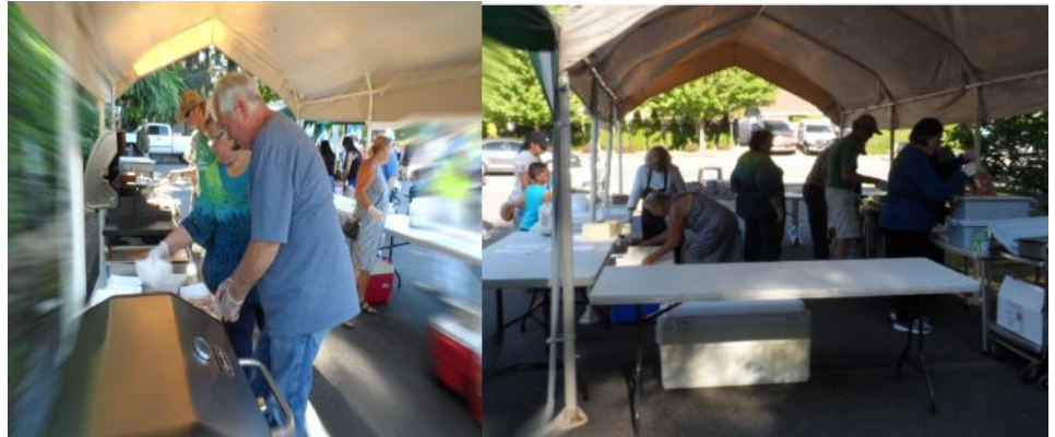
Tour de Terrace Free Hotdogs July 26, 2019